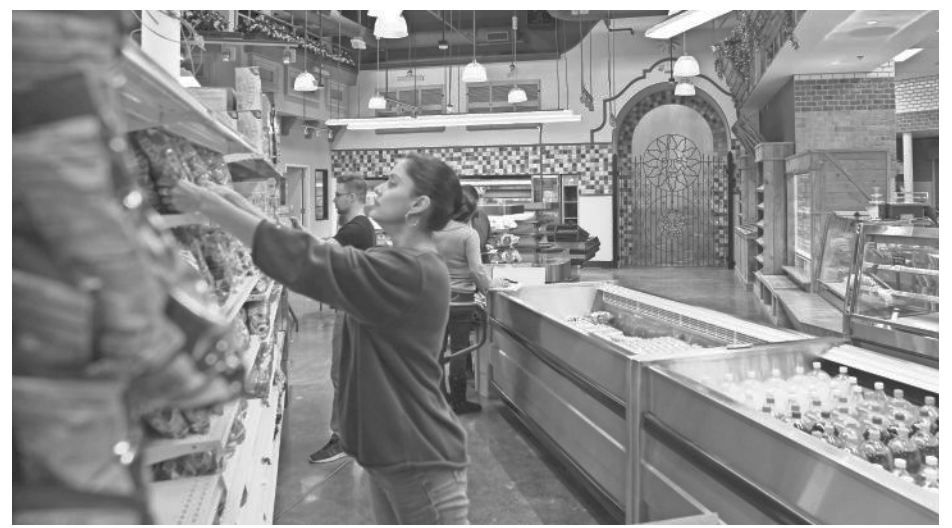
Mazfresco Market opened Sunday at the renovated former Elysian Fields Kroger store.